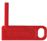
LK PL KEY