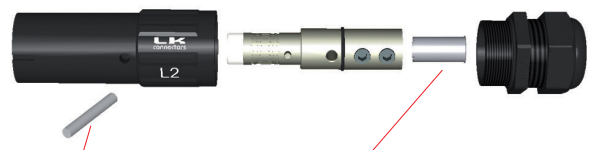
LK PL LOCK