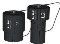
LK PL TPD**